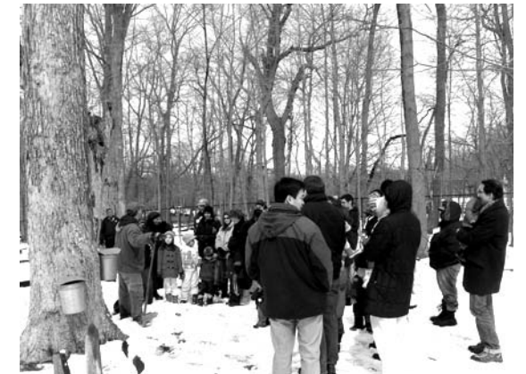
River Trail Sugar Bush