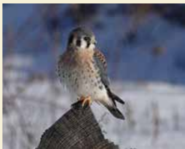
Kestrel at Somme Prairie Nature Preserve

*Registration required. Go to experience.nature@fpdcc.com to register unless otherwise noted.