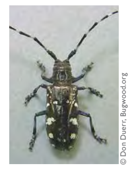
Asian longhorned beetle

Over the course of a year, beetle larvae develop into adults. The pupal stage lasts 13 to 24 days, usually in May or June. After adult beetles emerge, generally in July and August, from the pupae, they chew their way out of the tree, leaving round exit holes approximately <sup>3</sup>/<sub>8</sub> of an inch in diameter: (e.g. size of a dime). Once they have exited a tree, they feed on its leaves and bark for 10 to 14 days before mating and laying eggs. August is "Tree Check" month; check your trees for any round exit holes and adult beetles.