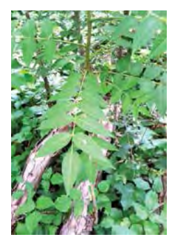
Tree of heaven