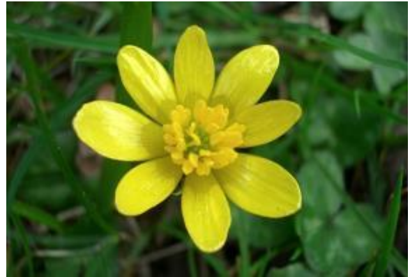
Lesser Celandine - 8 petals, symmetrical flower