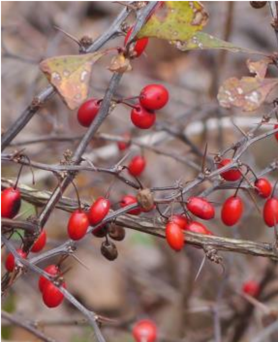
Bright red fruit and prominent thorns