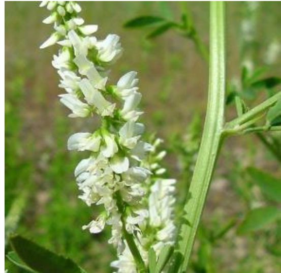
White Sweet Clover - Ribbed, fibrous stalk