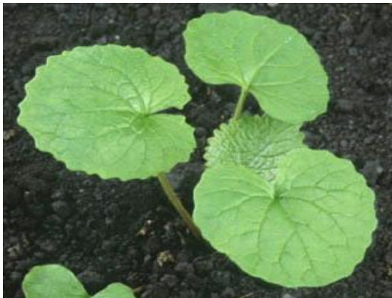
1 st year basal rosette