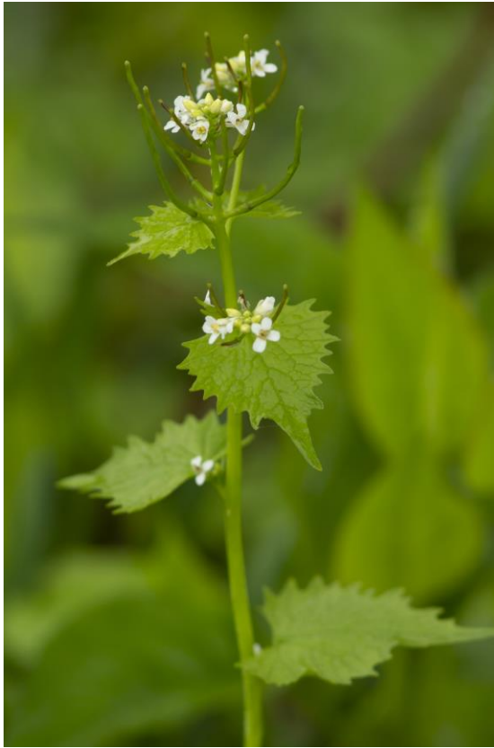
Triangular, coarsely toothed, broad leaves