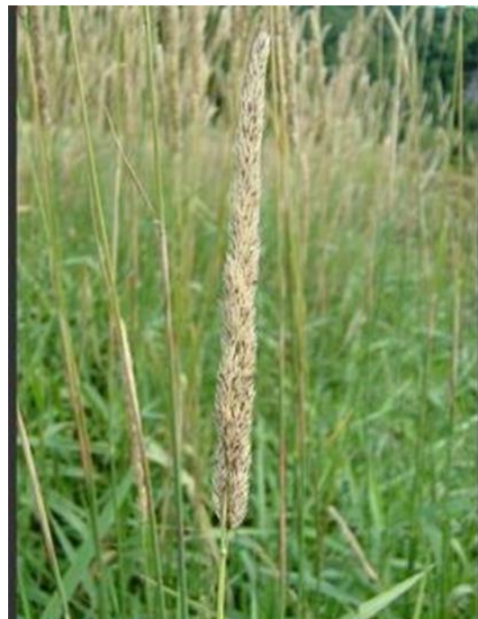
RCG in flower