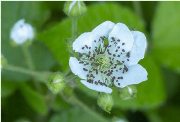
White flower and buds, 1.5in across