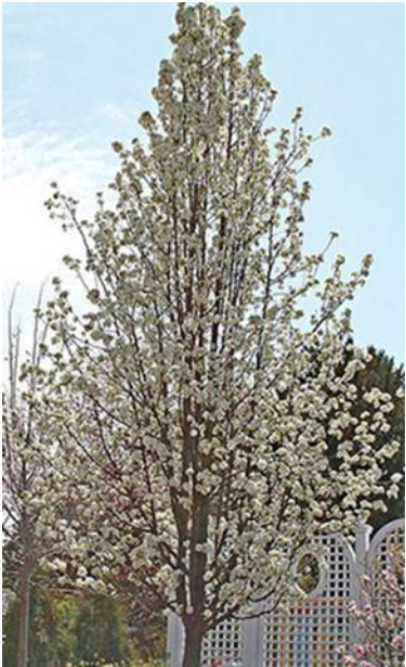
Pyramidal/oval growth form.