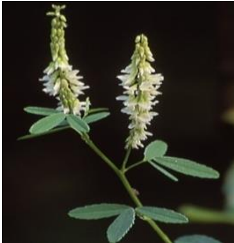
White Sweet Clover - Small, pea-like flowers, crowded on spiked, one sided raceme