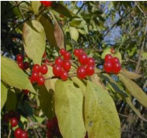
Bright red fruit ripe June – October