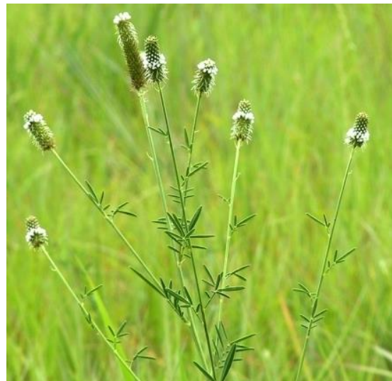
NATIVE white prairie clover ( Dalea candida ) with similar leaves. Flower heads are distinctly different.