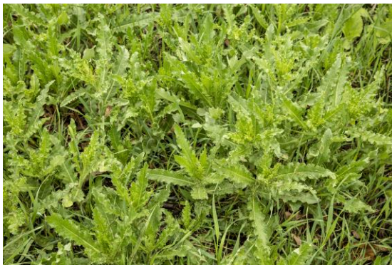
Clumps of Thistle