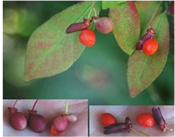
4 lobed purple capsules