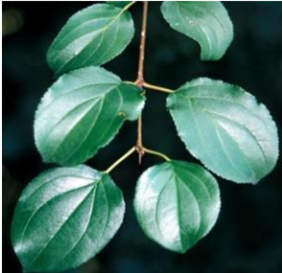
Leaf has arcuate venation & finely toothed