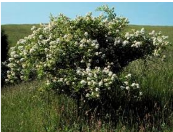
Open growth form in prairie community