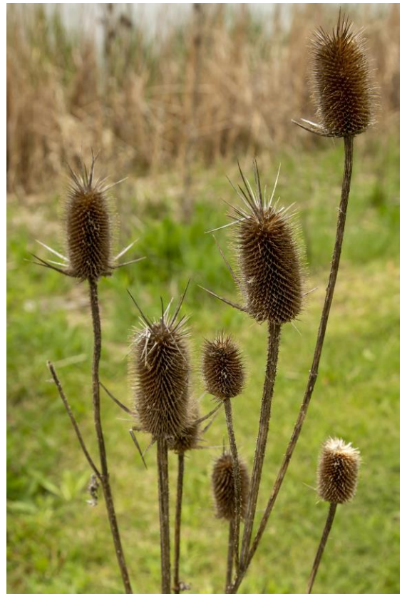
Sharp spines stem and seed heads, and multiple inflorescences