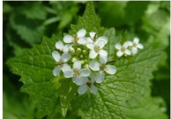
Terminal, white flowers with 4 petals