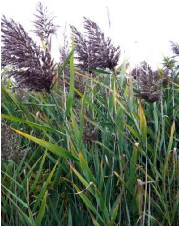
Dense growth form, up to 13ft tall