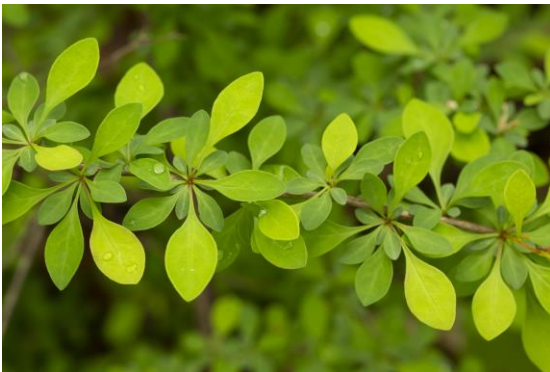
Small, oval leaves