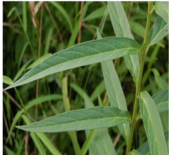
NATIVE: Swamp milkweed ( Asclepias incarnata ) veins form acute angles at midrib