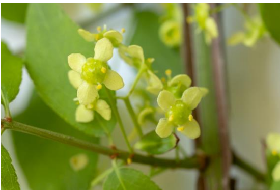
Burning bush flower