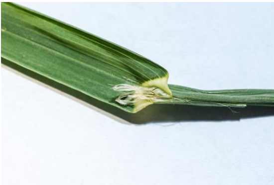
Prominent papery rounded ligule hairless stem