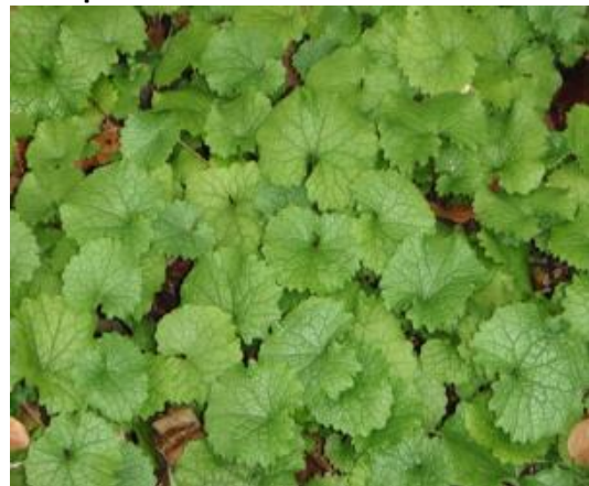
Dense cover of 1 st year basal rosettes