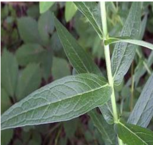
Purple loosestrife - Lance-shaped leaves, opposite on a square stem, sessile and lack teeth