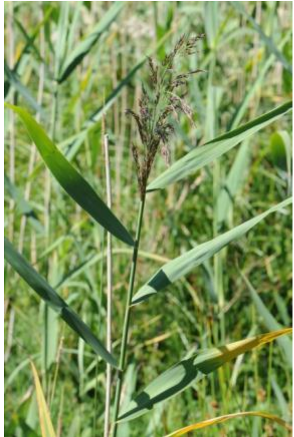
Broad 2in. wide leaves, 10-20in. long