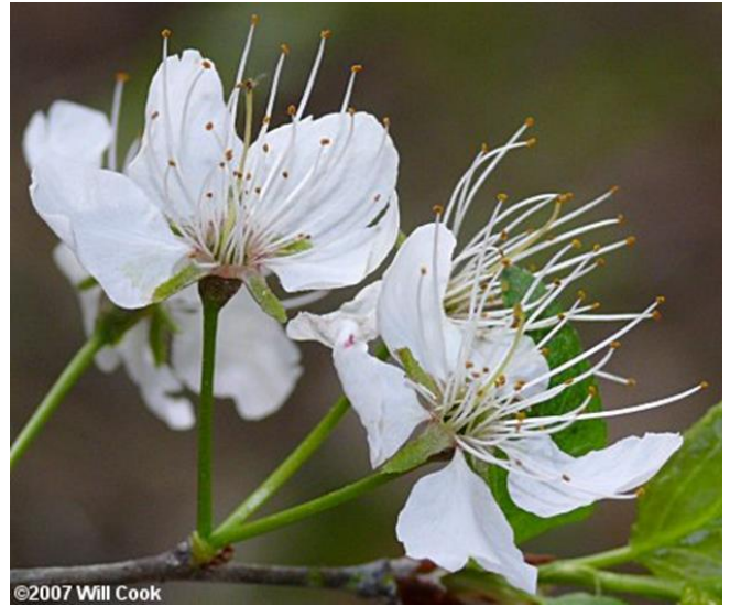
Native plums have stamens that are longer than the petals (see threadlike stalks in center of flower).