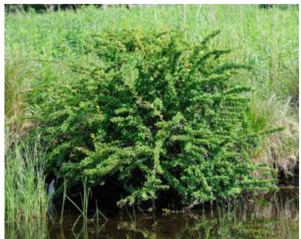
Open growth form in a prairie/wetland