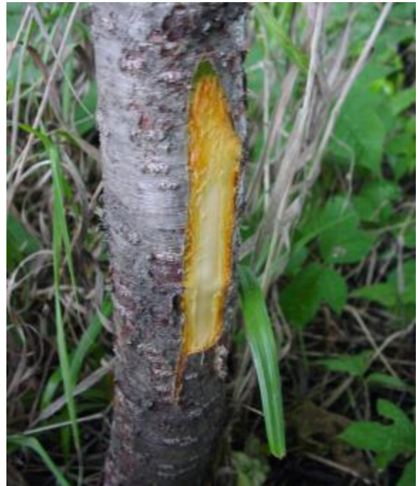
Buckthorn’s distinct inner orange bark