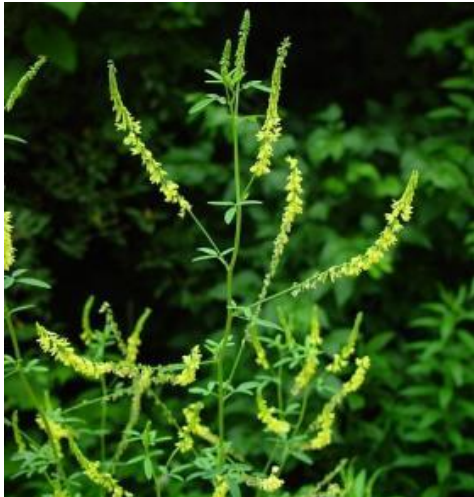
Yellow Sweet Clover Branched growth form