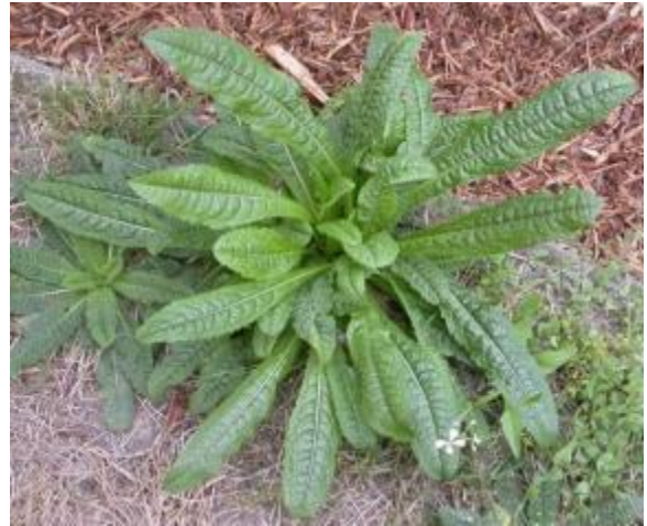
1 st year basal rosette