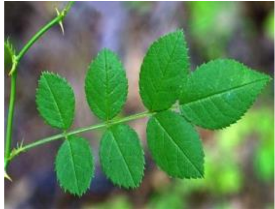
Sharply toothed leaflets, hairy stipule at base of stem