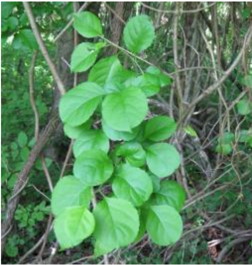
Alternate, 2-4in oblong leaves