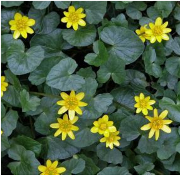
Lesser Celandine - invasive