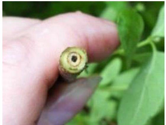
Hollow stem pith