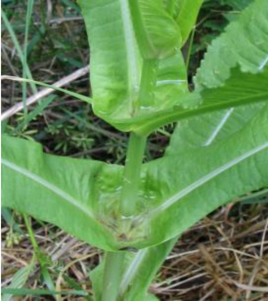
Common Teasel: Sessile leaves that form water holding “cup”