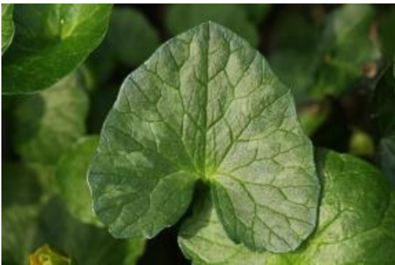
Lesser Celandine - Kidney/heart shaped leaf