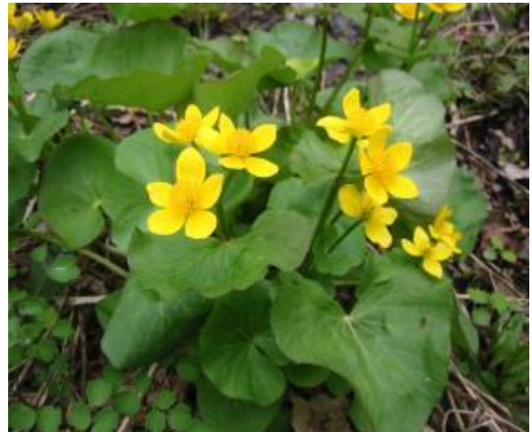
NATIVE: Marsh Marigold – 5-petals