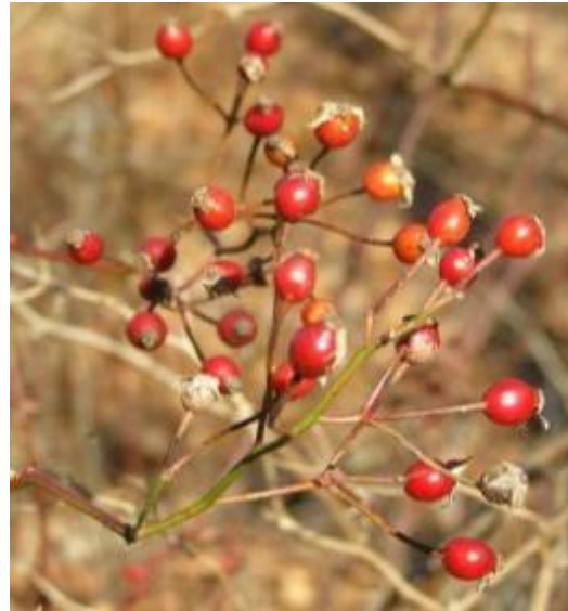
Dormant season rose hips