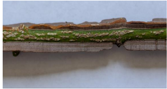
Winged-like structures found on branch