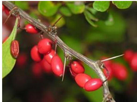
Grooved bark and thorns on nodes