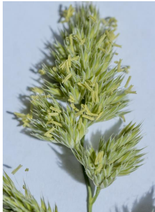
RCG starting to flower