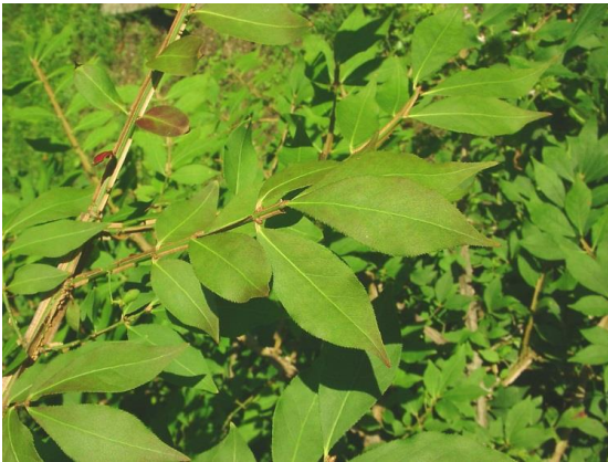
Opposite to slightly alternate leaves