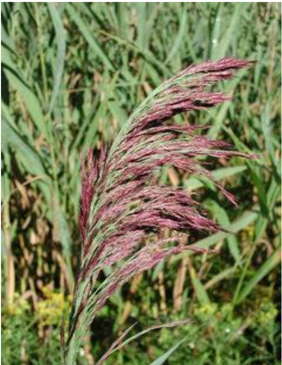
Purple-brown panicle that feathery out at maturity/seed set