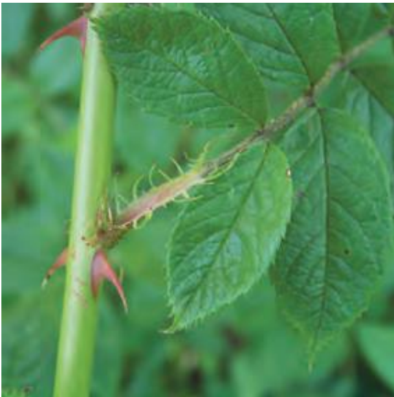
Recurved thorns and hairy stipule at the base of the stem