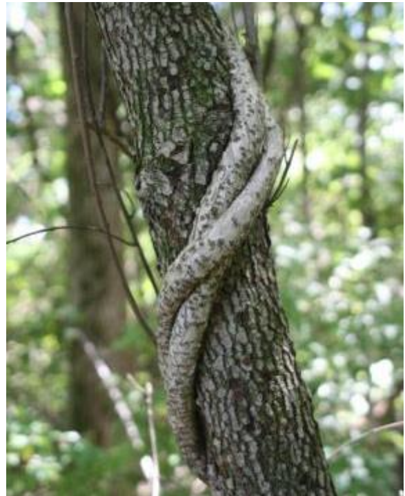
Vines climbing/wrapping tree