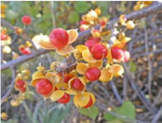
Yellow fruit capsule and red fruit inside