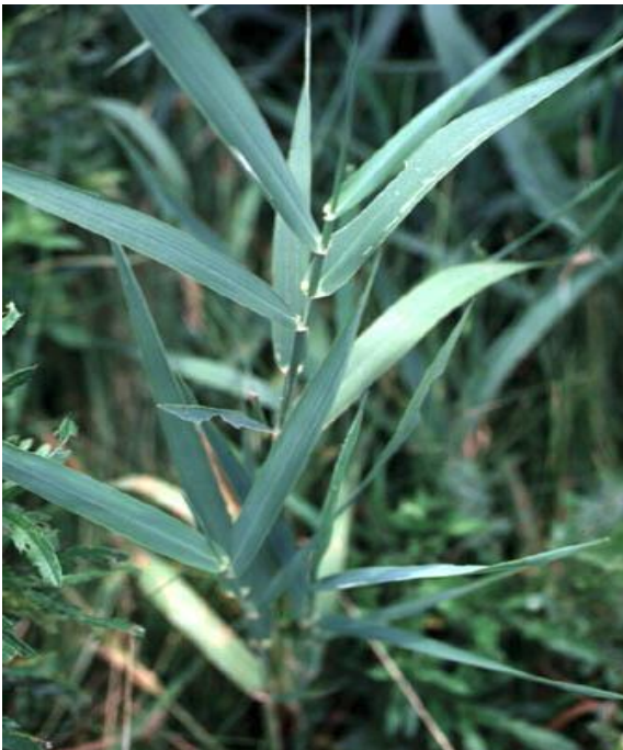
1in wide, 3-9in long leaves. Color can vary from green to blue-green.