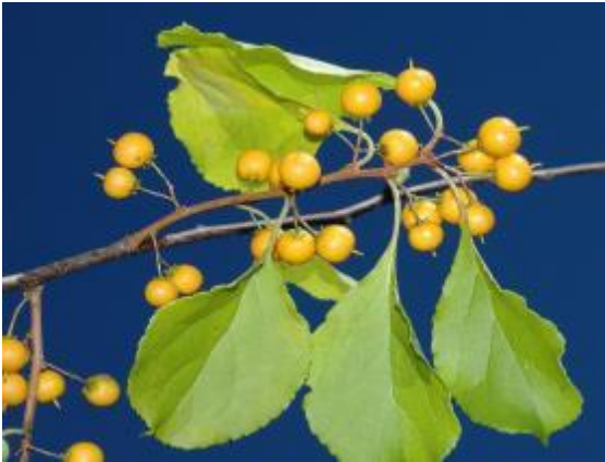
Clusters of 1-3 fruits, yellow in September