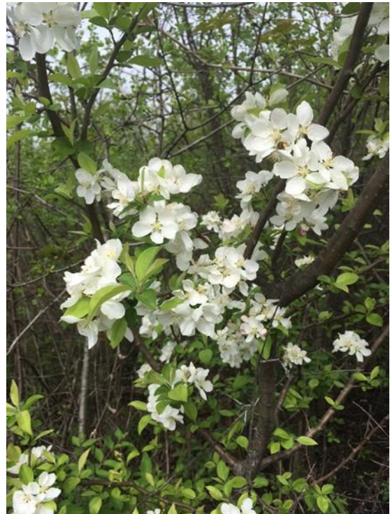
Apple and crabapple flowers have a slightly pink hue.