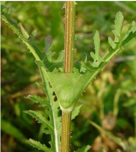
Cut-leaved Teasel: irregularly lobed forming a “cup”