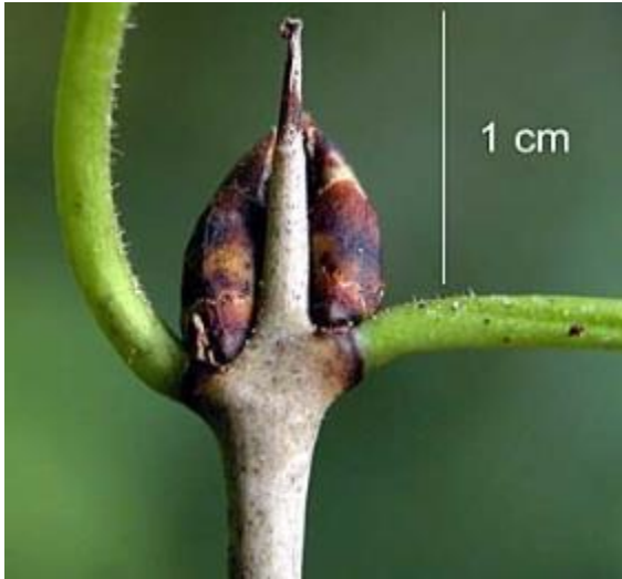
Distinct terminal “thorn”