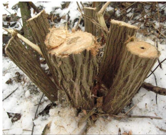
Larger, cut stems with bark pattern