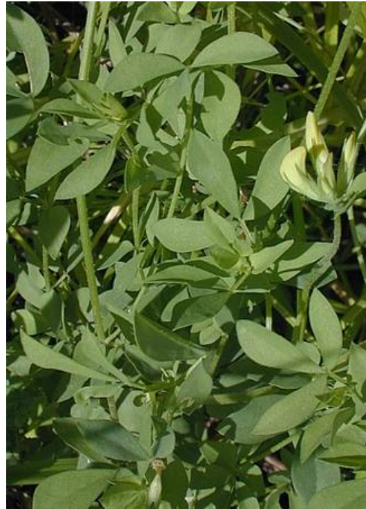
Clover like leaves