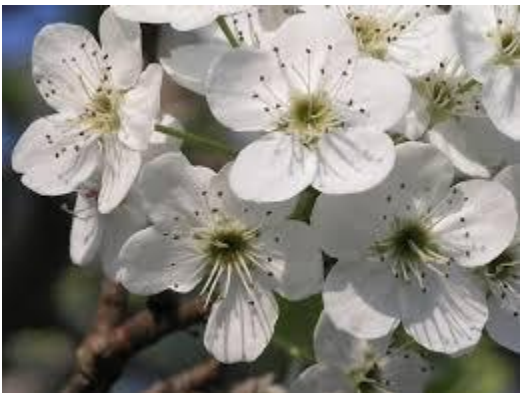
Five creamy white petals, 3/4" wide, in dense corymbs.