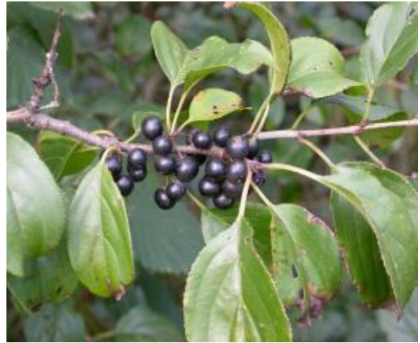
Ripe, deep purple/black fruit