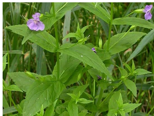
NATIVE: Monkey Flower ( Mimulus ringens ) has toothed leaves unlike the invasive with smooth