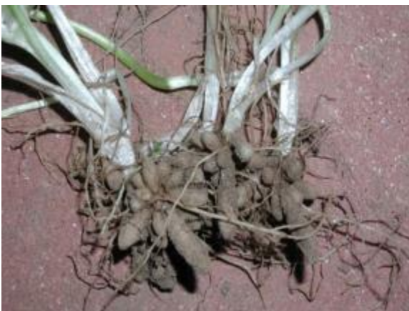
Lesser Celandine – distinct tubers mechanically removed