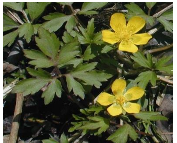
NATIVE: Swamp Buttercup with 5 petals and are deeply cleft leaves