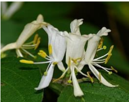
Fragrant flowers are tubular with very thin petals and appear in late spring