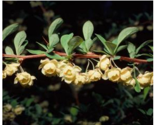
Pale flowers, umbrella shaped clusters of 2-4