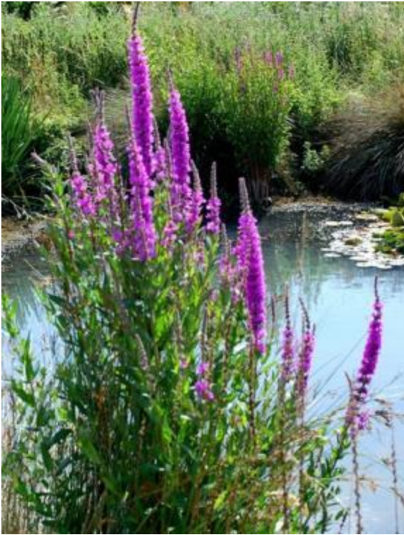
Purple loosestrife – full growth form near standing water