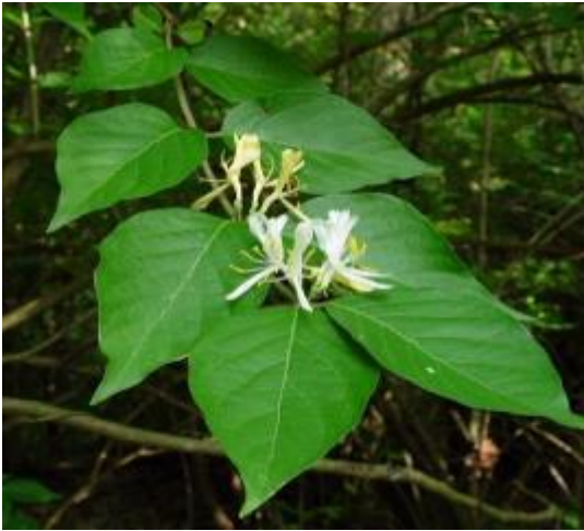
Simple, opposite leaves, green above, paler and slightly fuzzy below