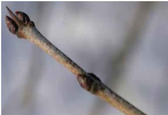
Note the terminal “thorn” during winter ID