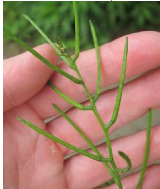
Seed pods before seed burst