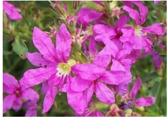
Purple loosestrife - 5-6 purple petals and 8 stamens